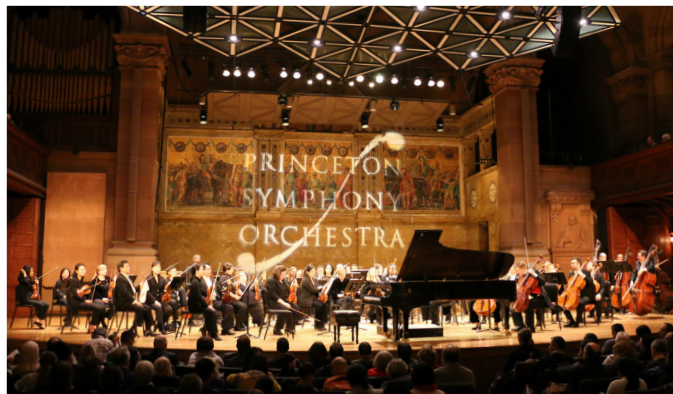
The Princeton Symphony Orchestra at Richardson Auditorium.

Concerts are held at Richardson Auditorium on the Princeton University (PU) campus. There are six concerts, beginning in late September, on Saturday evenings and repeated at Sunday matinées. Prices range from $282 to $462 per subscription.