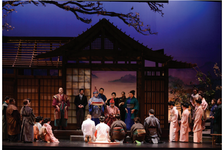
The Princeton Festival production of Madame Butterfly , presented at the Matthews Theater at McCarter during the 2018 season.

Purchase your own tickets online or by phone.