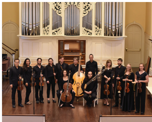
Concordia Chamber Players in the Miller Chapel at the Princeton Theological Seminary, during the 2018 season of the Princeton Festival.

During the month of June, the Princeton Festival presents a wide variety of musical programs, including opera, chamber music, jazz, orchestra, and theater performances at several venues throughout Princeton. They also offer free lectures and workshops. Windrows will provide a bus for one opera performance.